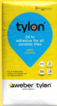
WB11 Ceramic 20 kg