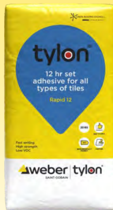
Rapid 12 20 kg

Designed and developed for the professional tiling contractor offering solutions for all setting times and types of tiles.