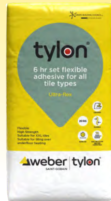
Ultra-flex 20 kg