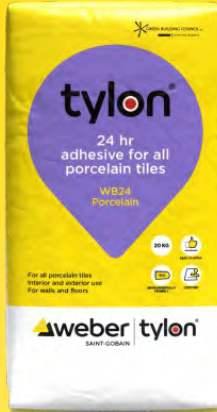
WB24 Porcelain 20 kg

Designed and developed for the professional tiling contractor offering solutions for all setting times and types of tiles.