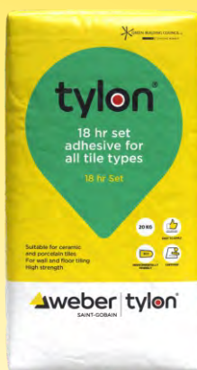
18 hr Set 20 kg