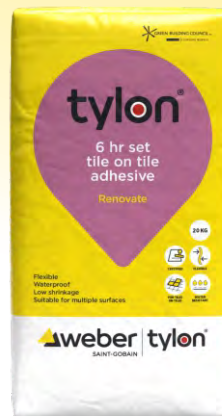
Renovate 20 kg

Can be used on a wide range of surfaces, are easy to mix, and provide a strong, reliable bond for a long-lasting finish.