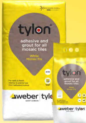
Mosaic Fix 5 kg 20 kg