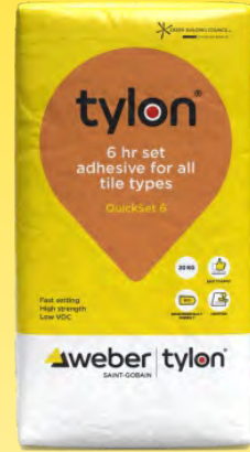
QuickSet 6 20 kg

Can be used on a wide range of surfaces, are easy to mix, and provide a strong, reliable bond for a long-lasting finish.